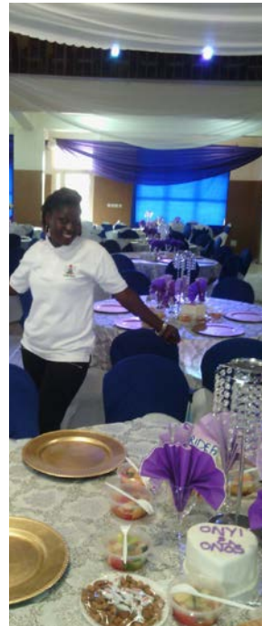
Event Management & Decoration Trainee