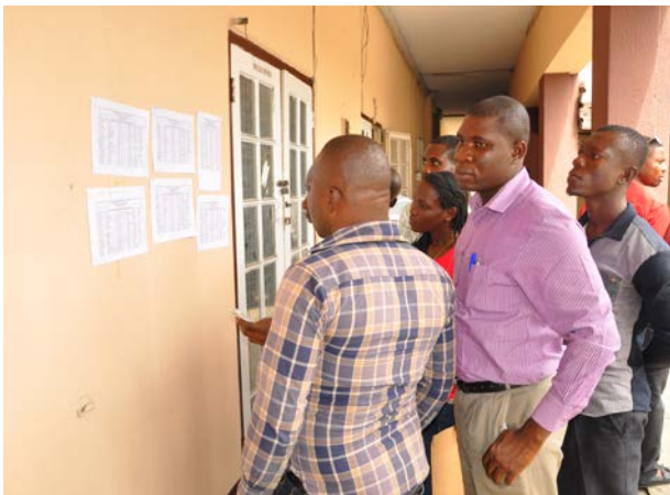
Applicants checking for their names on the notice board in one of the local governments