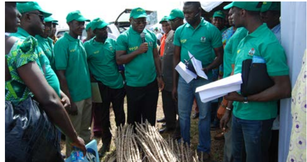
Distribution of cassava Stems