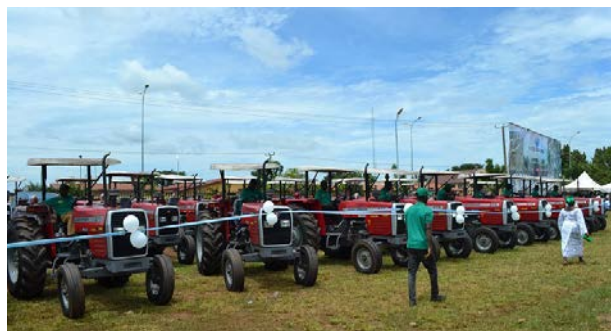
Tractors on display