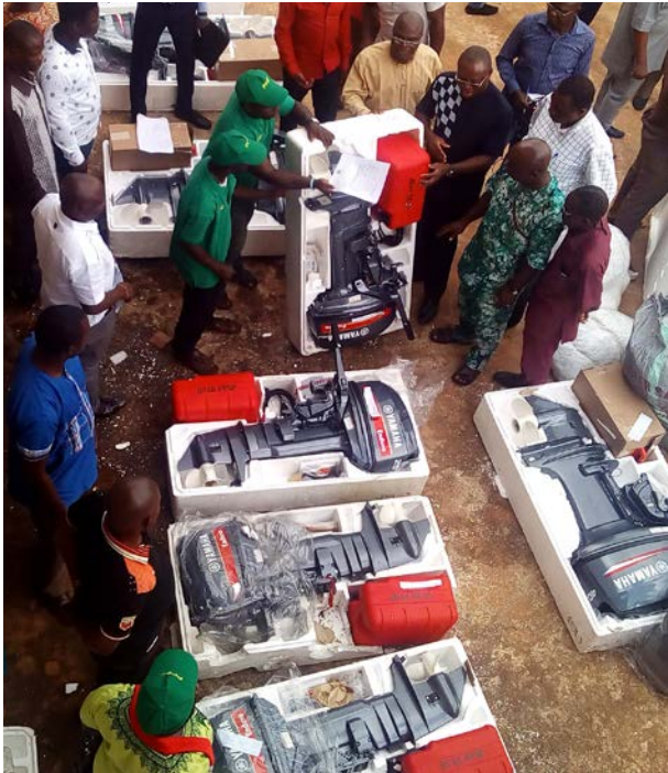
Chief Job Creation Officer gives out out-board engines to beneficiaries