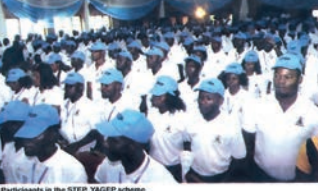
Participants in the STEP, YAGEP scheme.

The NEP is a three-year programme aimed at creating 10,000 jobs for the youth in the country. It is a joint venture between the Federal Government and the private sector.