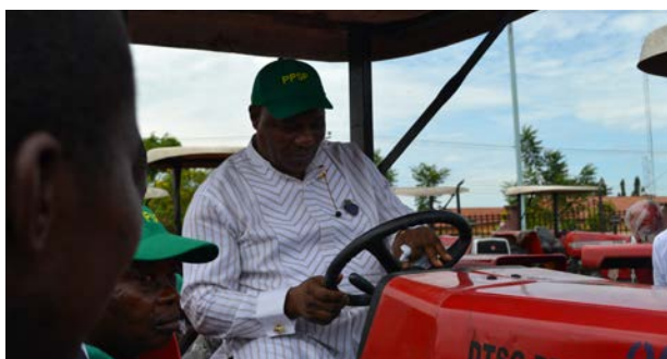
Deputy Governor Otuaro also doing same