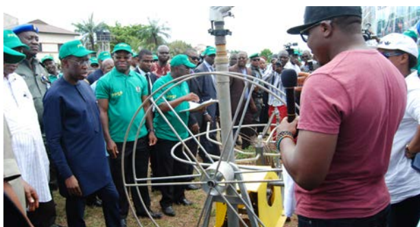
HE inspecting Irrigation machine