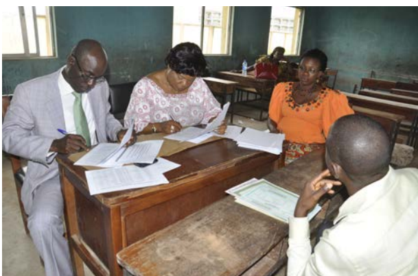
Interview session in progress