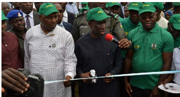
Commissioning of the Government purchased tractors distributed to Farmers Cooperative Societies