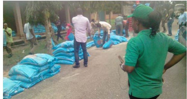
Distribution of Poultry Feeds