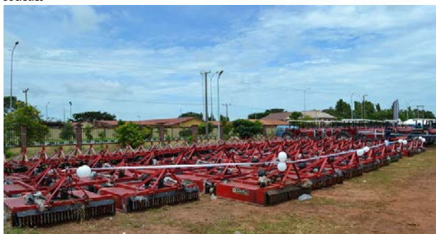
Outgrowers on display