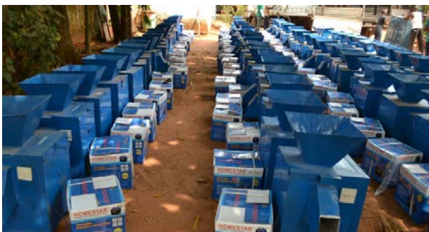
The melon shellers/generators and fish smoking kilns on display