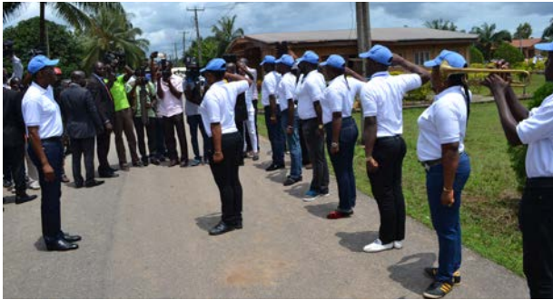
Trainees welcoming Governor Ifeanyi Okowa to the Orientation Programme at Songhai-Delta, Amukpe