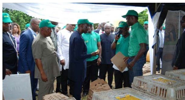
HE inspecting a chick at PPSP launch