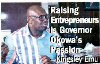
Governor Okowa speaking at the NEP launch.

The NEP is a three-year programme aimed at creating 10,000 jobs for the youth in the country. It is a joint venture between the Federal Government and the private sector.