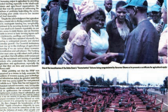
Governor Okowa distributing tractors to farmers.

Governor Ifeanyi Okowa recently put smiles on the faces of many farmers in Delta State, when he gave out 40 tractors and N30 million to the different farm-based agricultural cooperatives in the state, writes Omon-Julius Onabu