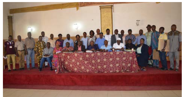
YAGEP Trainers with Staff of the Office of the Chief Job Creation Officer