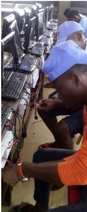
Computer Repairs Trainees