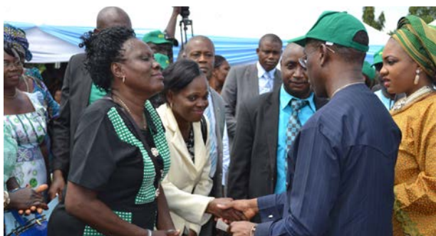
Giving out cheques to women under the Delta State Microcredit Programme at the PPSP launch