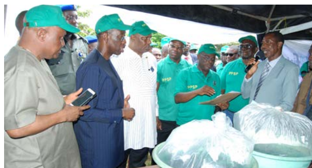
Inspection of fish fingerlings at PPSP launch