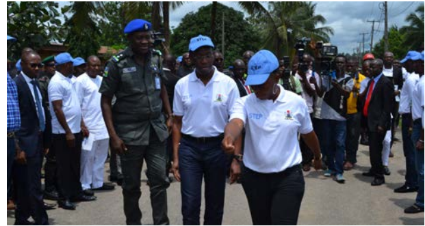
Governor Okowa inspects a guard of honour