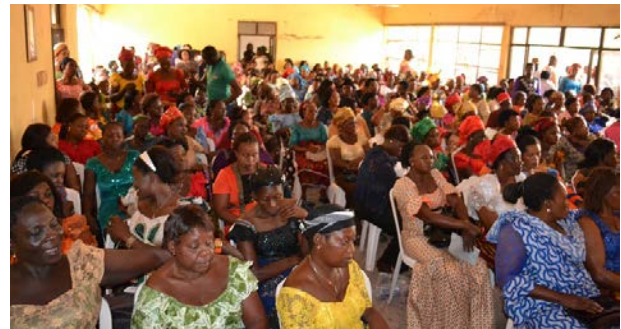
A cross-section of the beneficiaries during the flag off/grant of melon shellers/generators and fish smoking kilns in Asaba