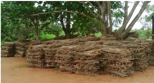
Improved Cassava Stems for distribution