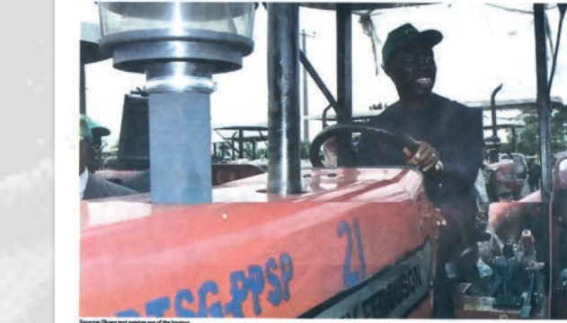
Governor Okowa distributing tractors to farmers.

Governor Ifeanyi Okowa recently put smiles on the faces of many farmers in Delta State, when he gave out 40 tractors and N30 million to the different farm-based agricultural cooperatives in the state, writes Omon-Julius Onabu