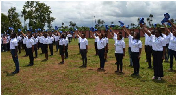
Taking the salute