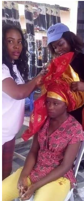
Hair Dressing & Make over Trainees