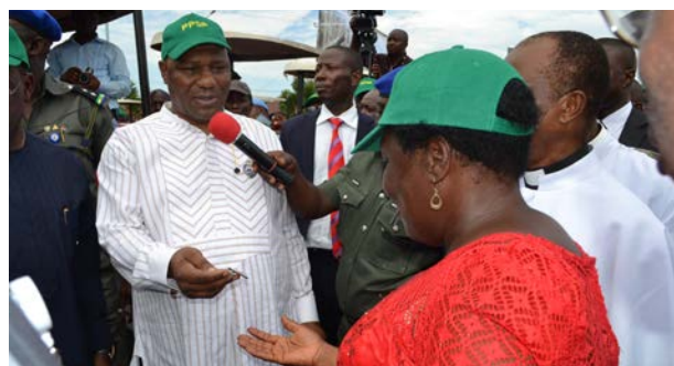
The Deputy Governor handing out keys of a tractor to one of the beneficiaries