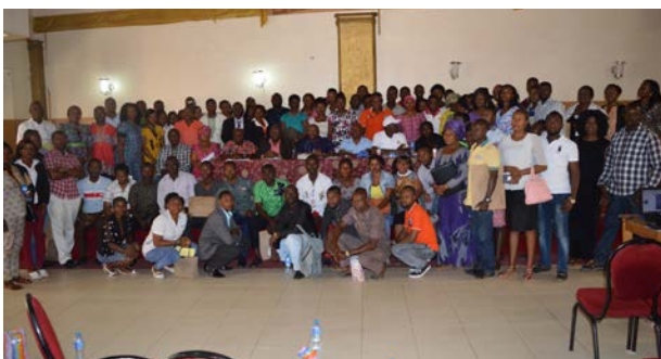
STEP Trainers with Staff of the Office of the Chief Job Creation Officer