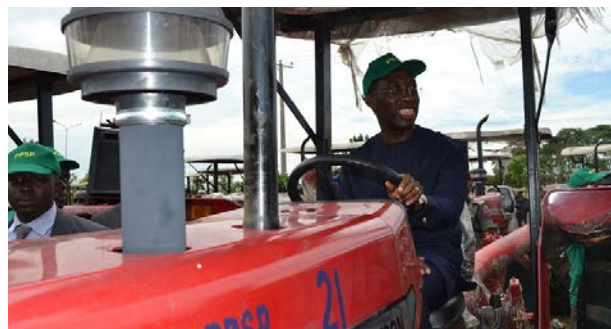
Governor Okowa test driving one of the tractors