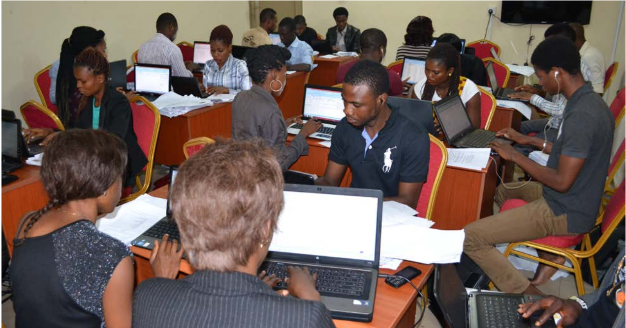
Inputting the data of over 60,000 applicants for YAGEP and STEP