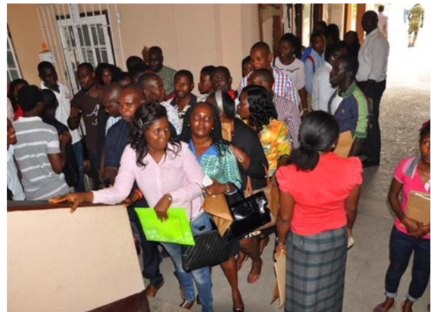
Applicants queuing to be interviewed