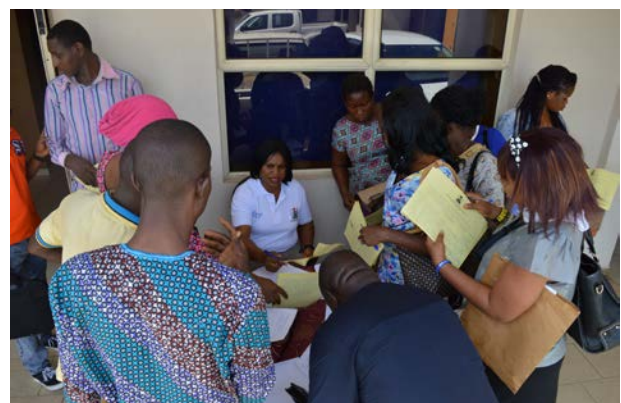
Trainers submitting Log Sheets