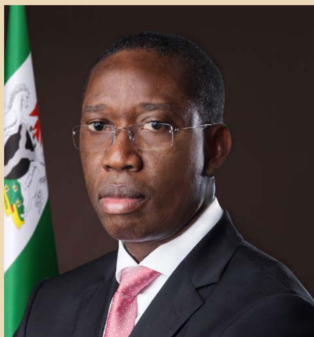
His Excellency, Sen. Dr. Ifeanyi Okowa, Governor of Delta State

6. It is for this reason that this administration is very passionate, deliberate and focussed in our quest to formulate tangible and lasting policies and/or programmes to support the small business sector. The