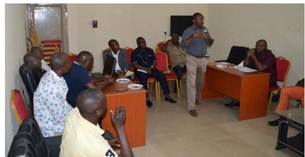
YAGEP Sites Construction Coordinators meeting