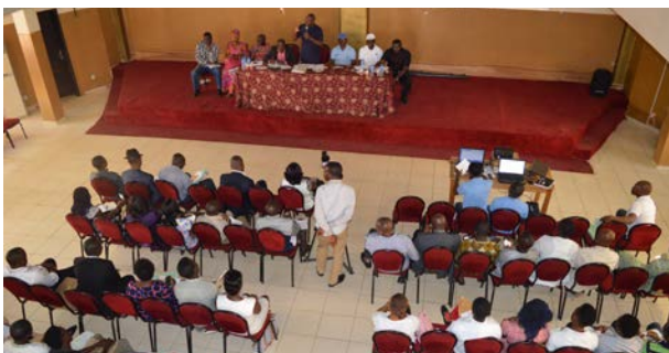
Trainers Meeting with Chief Job Creation Officer