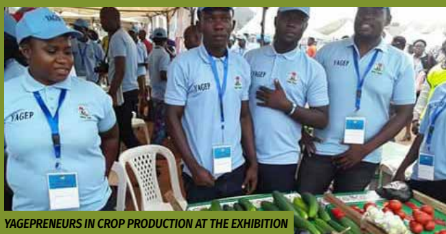
YAGEPRENEURS IN CROP PRODUCTION AT THE EXHIBITION