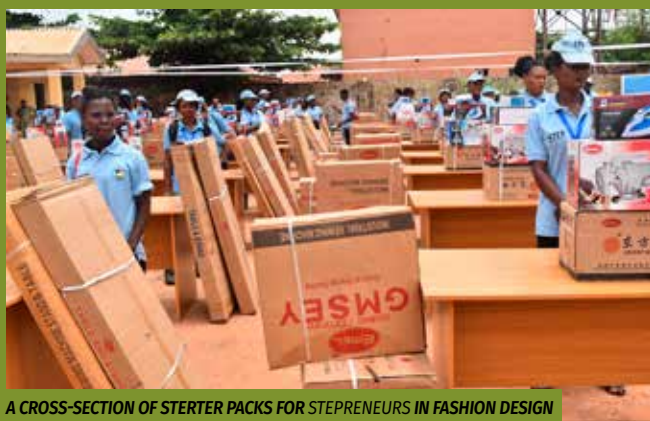
A CROSS-SECTION OF STARTER PACKS FOR STEPRENEURS IN FASHION DESIGN