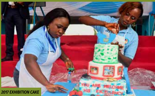
2017 EXHIBITION CAKE

GOV. IFEANYI OKOWA, GOV. AMINU TAMBULWAL (2ND RIGHT), FORMER GOV. JAMES IBORI (2ND LEFT) AND OTHERS AT THE PRODUCTS EXHIBITION AND BUSINESS FAIR