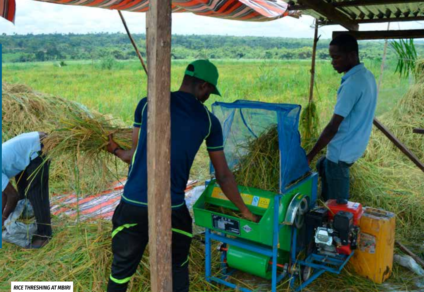
RICE THRESHING AT MBIRI