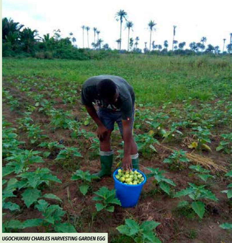
UGOCHUKWU CHARLES HARVESTING GARDEN EGG

I have completed four crop production cycles at Songhai Delta YAGEP Cluster, but decided to leave the land to fallow for a while to regain its nutrients. At present, I am in partnership with a friend at Odovieh after Ughelli where