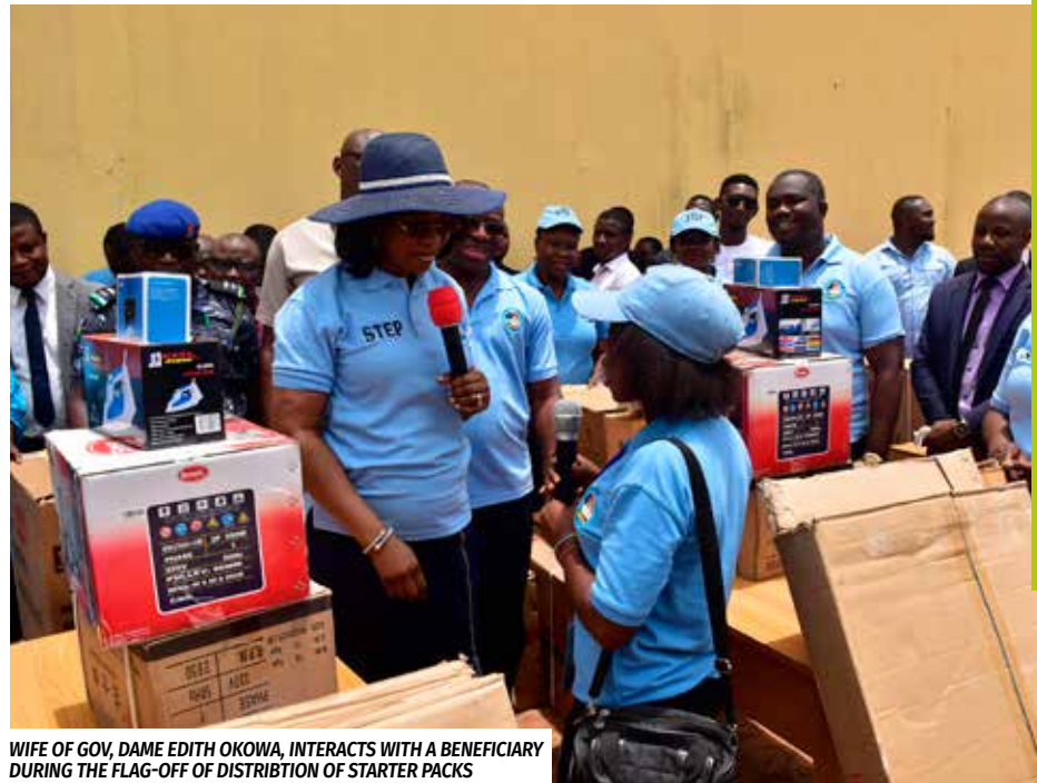
WIFE OF GOV, DAME EDITH OKOWA, INTERACTS WITH A BENEFICIARY DURING THE FLAG-OFF OF DISTRIBUTION OF STARTER PACKS

He affirmed that the programmes are transforming the lives of the beneficiaries, creating livelihoods, changing the landscape of youth empowerment and stimulating economic diversification of the State. The Chief Job Creation Officer informed