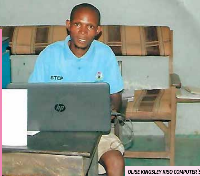
OLISE KINGSLEY KISSO COMPUTER'S