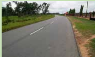
Okpare-Umolo-Ovwodokpokpor- Kiagbodo Road, Ughelli South/Bomadi LGAs