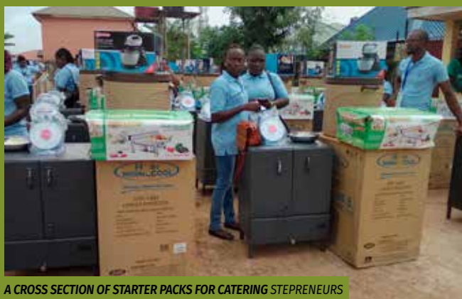
A CROSS SECTION OF STARTER PACKS FOR CATERING STEPRENEURS