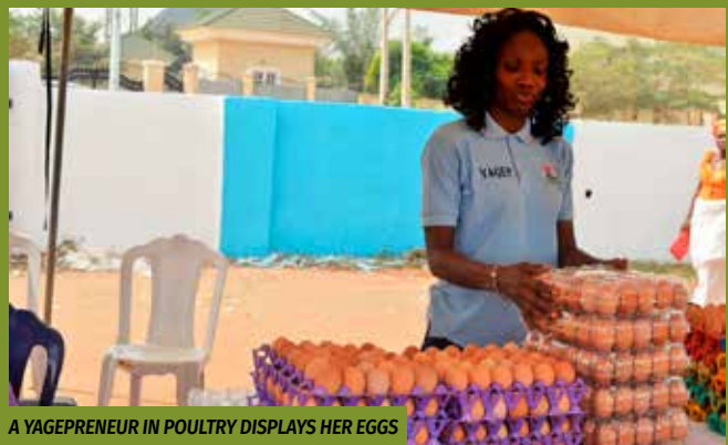
A YAGEPRENEUR IN POULTRY DISPLAYS HER EGGS