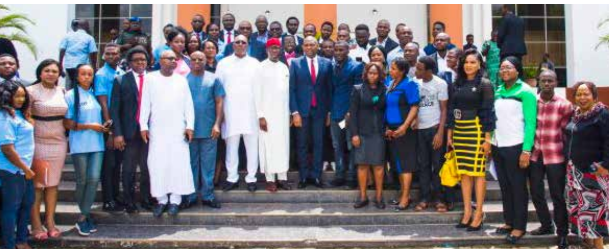
GOV OKOWA (IN RED CAP), FLANKED BY HIS DEPUTY OTUARIO (LEFT) AND TONY ELUMELU (RIGHT) WITH OTHER TOP GOVERNMENT FUNCTIONARIES AND TEF BENEFICIARIES

the areas of skills and technical development and will work with the Job Creation Office of the State Government to strengthen the labour market observatory system in order to make Governor Okowa’s dream of re-creating the middle class a reality.”