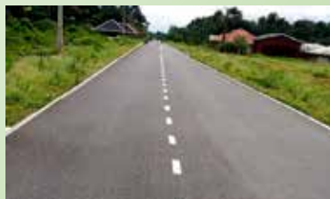
Obotobo I-Obotobo II-Sokebolou-Yokri-Ogulaha Road, Burutu LGA

In 2015, I promised to embark on massive infrastructural development for the purposes of urban renewal and rural-urban integration. We have surpassed even our expectations in this regard. As at December 31, 2018, my administration has embarked on 357 road projects (comprising 1,056.15 kms of roads and 352.78 kms of drains ).