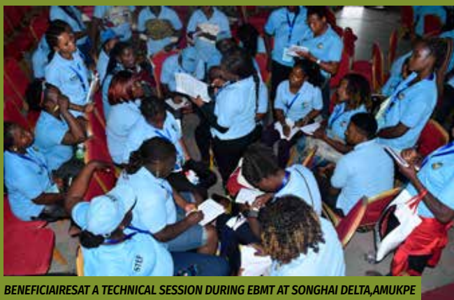
BENEFICIARIES AT A TECHNICAL SESSION DURING EBMT AT SONGHAI DELTA, AMUKPE