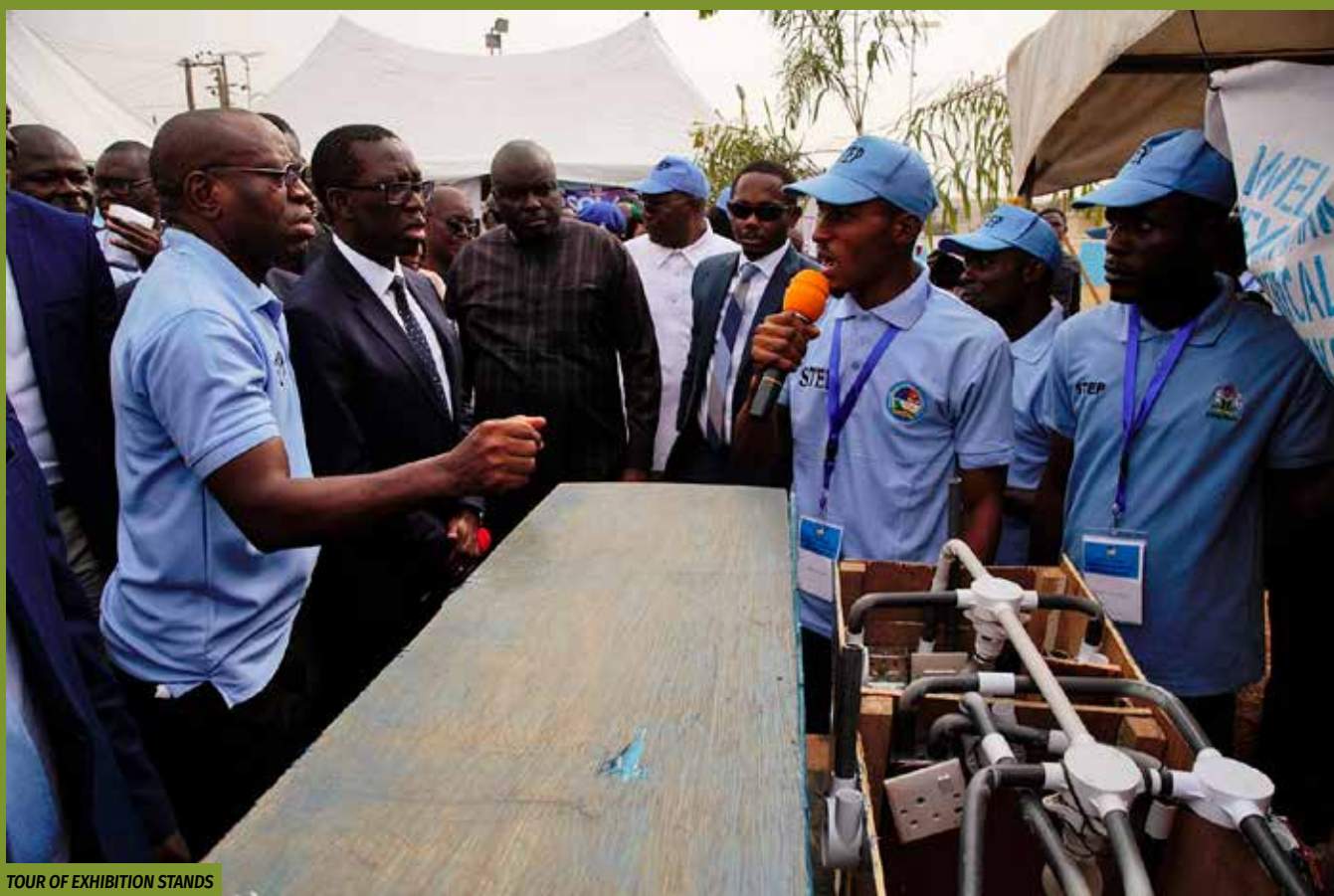
TOUR OF EXHIBITION STANDS