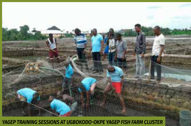
YAGEP TRAINING SESSIONS AT UGBOKODO-OKPE YAGEP FISH FARM CLUSTER