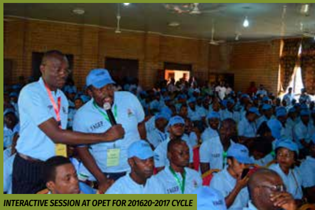
INTERACTIVE SESSION AT OPET FOR 2016/2017 CYCLE