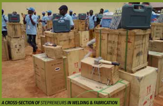
A CROSS-SECTION OF STEPRENEURS IN WELDING & FABRICATION