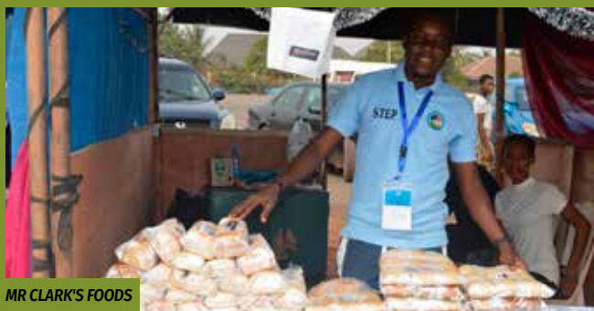
MR CLARK'S FOODS