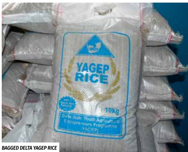
BAGGED DELTA YAGEP RICE

"Many farmers have learnt new, improved rice production techniques and practices through the YAGEP rice production processes."