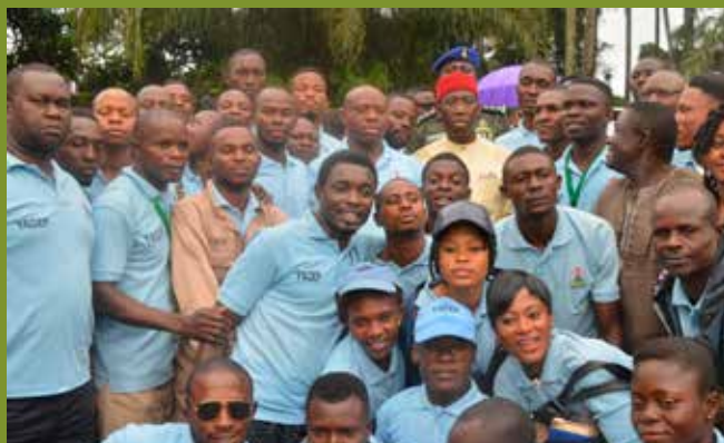
GOV. OKOWA IN A GROUP PHOTOGRAPH WITH YAGEPRENEURS IN UGBOKODO-OKPE YAGEP FISH CLUSTER