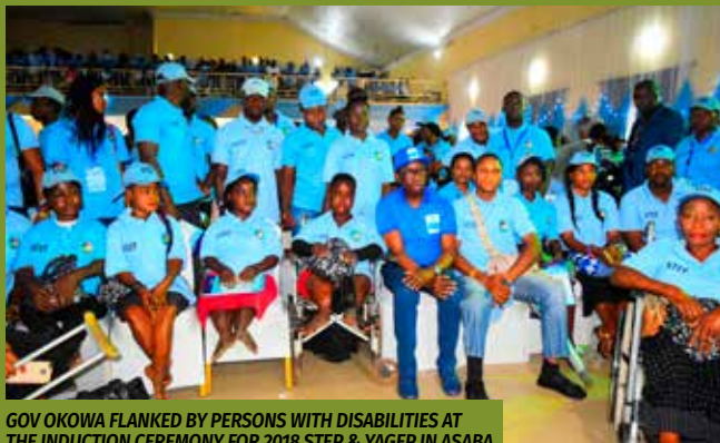
GOV OKOWA FLANKED BY PERSONS WITH DISABILITIES AT THE INDUCTION CEREMONY FOR 2018 STEP & YAGEP IN ASABA