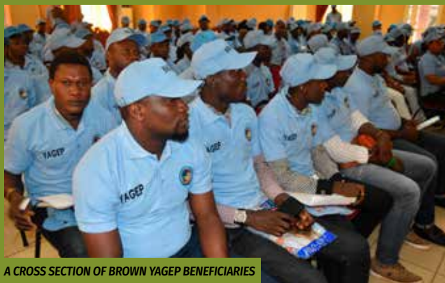
A CROSS SECTION OF BROWN YAGEP BENEFICIARIES