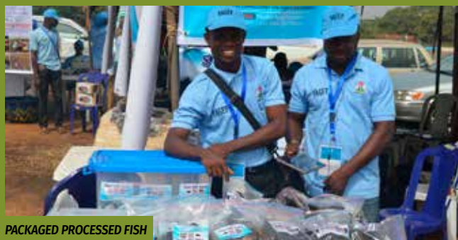
PACKAGED PROCESSED FISH