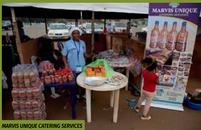
MARVIS UNIQUE CATERING SERVICES