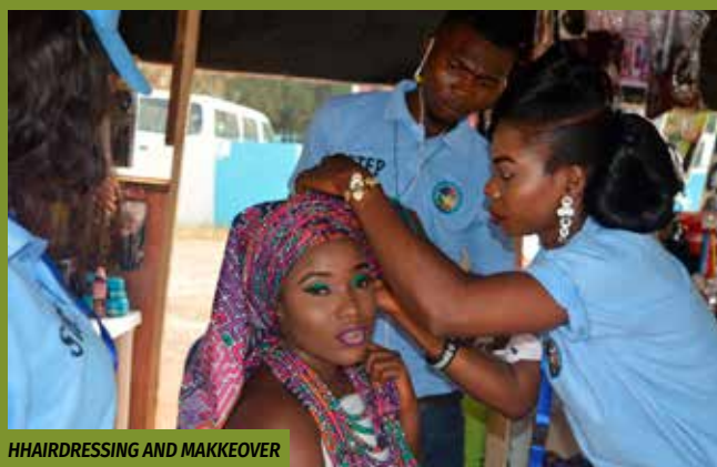
HHAIRDRESSING AND MAKKEOVER