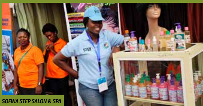
SOFINA STEP SALON & SPA