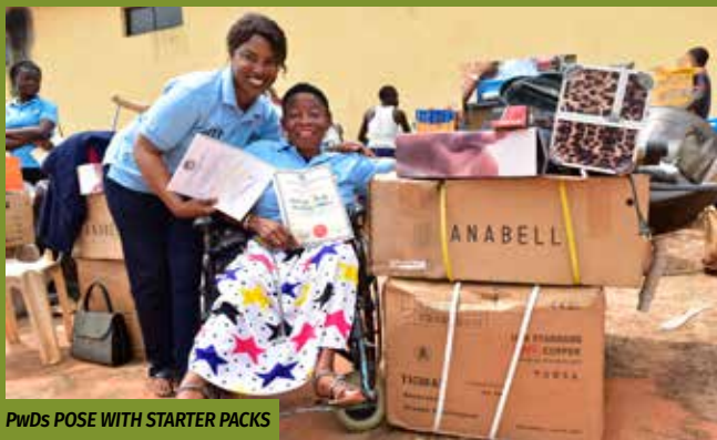
PwDs POSE WITH STARTER PACKS