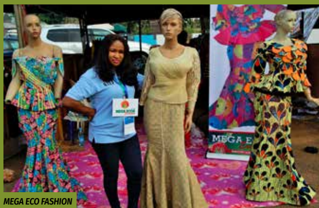
MEGA ECO FASHION