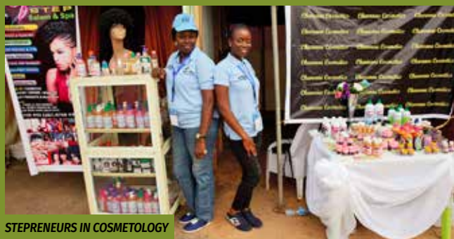
STEPRENEURS IN COSMETOLOGY