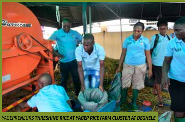
YAGEPRENEURS THRESHING RICE AT YAGEP RICE FARM CLUSTER AT DEGHELE