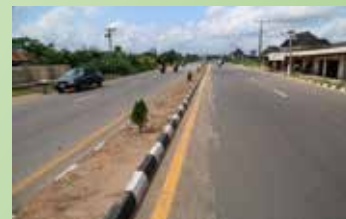
Dualised Access Road to Jesse Town, Ethiope West LGA