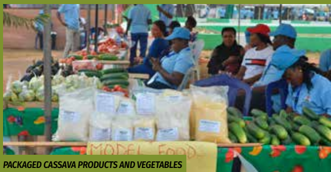
PACKAGED CASSAVA PRODUCTS AND VEGETABLES