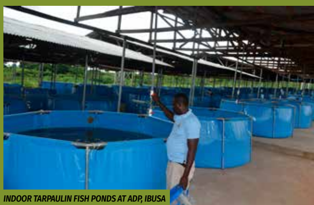
INDOOR TARPULIN FISH PONDS AT ADP, IBUSA