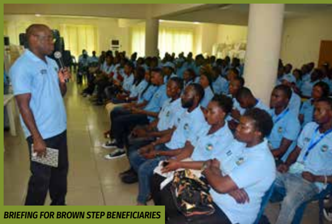
BRIEFING FOR BROWN STEP BENEFICIARIES