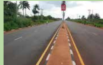
Old Lagos-Asaba Road, Boji Boji, Ika North East/Ika South LGAs

A vote for me is a vote for the good work to continue.