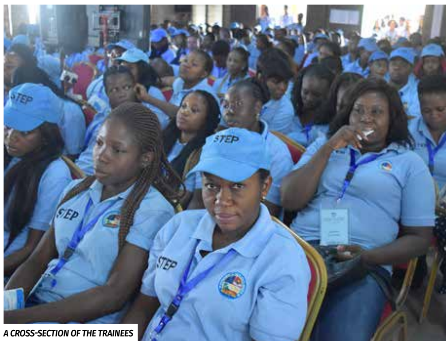
A CROSS-SECTION OF THE TRAINEES