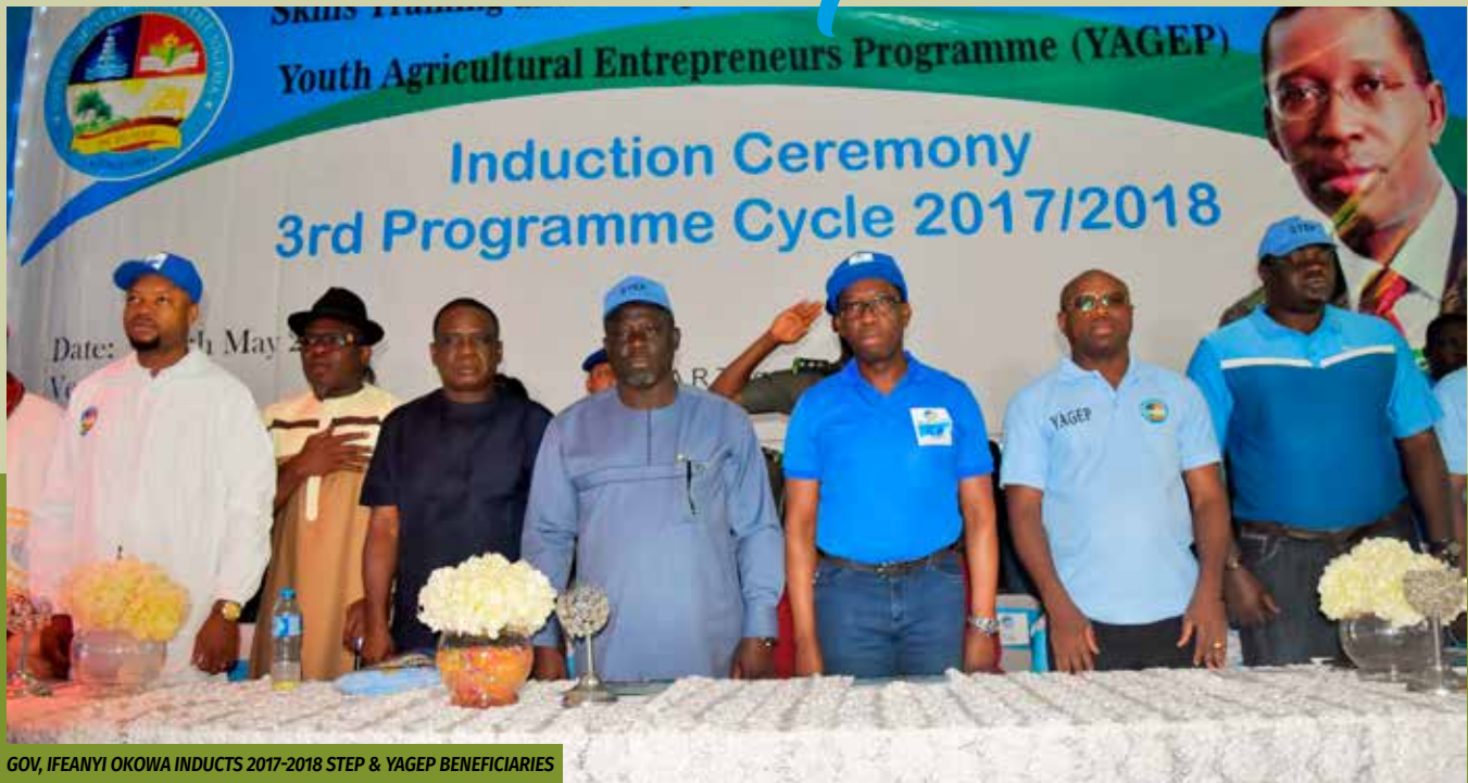
GOV, IFEANYI OKOWA INDUCTS 2017-2018 STEP & YAGEP BENEFICIARIES