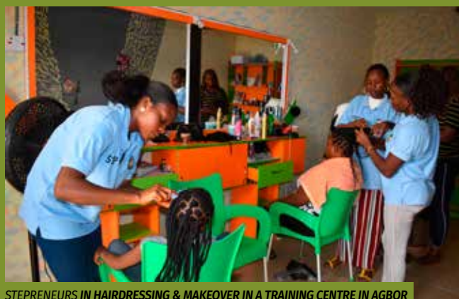
STEPRENEURS IN HAIRDRESSING & MAKEOVER IN A TRAINING CENTRE IN AGBOR