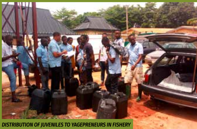
DISTRIBUTION OF JUVENILES TO YAGEPRENEURS IN FISHERY