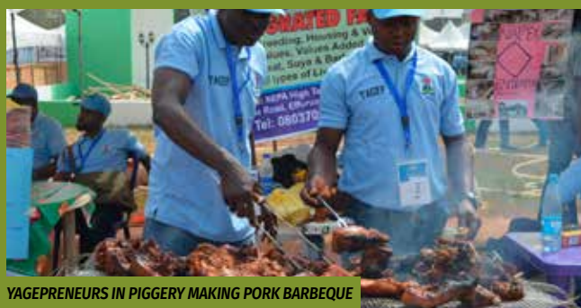
YAGEPRENEURS IN PIGGERY MAKING PORK BARBEQUE