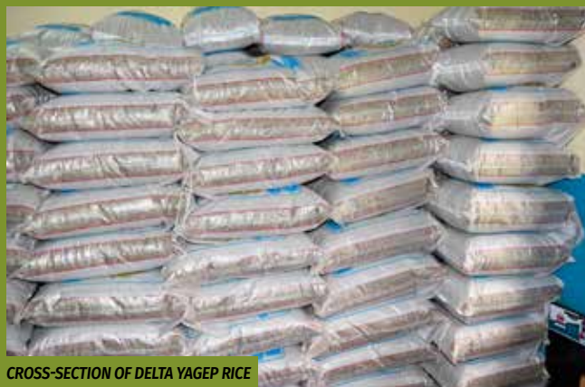
CROSS-SECTION OF DELTA YAGEP RICE