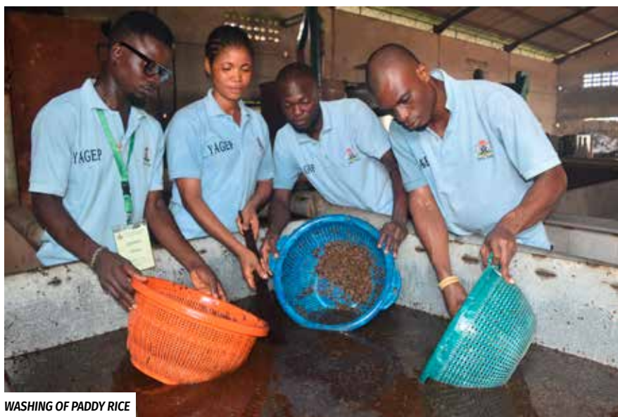
WASHING OF PADDY RICE

42 hectares at Deghele, Sapele Local Government Area and 54 hectares at Mbiri, Ika North East Local Government Area. A total of 48 trainees were trained and established in these two rice farm clusters, 21 at Deghele and 27 at Mbiri. These 48 trainees worked under close tutorials, facilitation and guidance of the Office of the Chief Job Creation Officer through knowledgeable and experienced resource persons from within and outside the State.